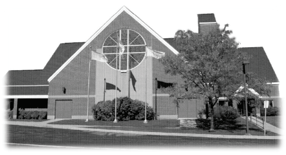
"... The seed is sprouting and growing ..." (Mark 4:27)

Wednesdays & First Fridays 11:00 - 11:45 AM Saturdays 4:15 - 4:45 PM or by appointment